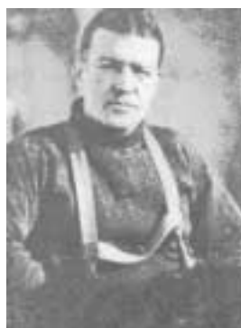
Scott Polar Research Institute